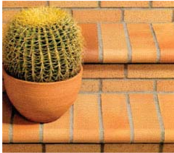
Pacific Clay is long known for its quality, crafted bullnose brick. Combining design, elegance and safety, these products offer you the finest in pool coping materials.

The Pacific Clay Products' Poolside Collection is the perfect answer when seeking rich, earthy colors, patterns and exquisite textures. Utilized independently, or combined theme, the Pacific Clay Products' Poolside Collection is an excellent choice for exterior or interior designs.